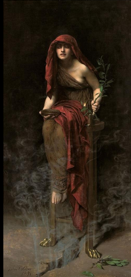
John Collier, Prêtresse de Delphes, 1891